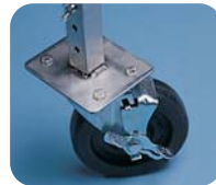
Corner posts on heavy duty castors with ball-bearing pivots, two with foot activated brakes.