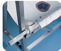
Lower sling support bar brackets for easier access.