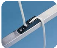
Self-locking, quick release cleats for limb ropes at each corner.