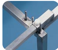
Locator pins on all corners to adjust sling support bars.