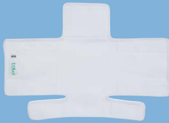
"Guinea Pig Snuggle"